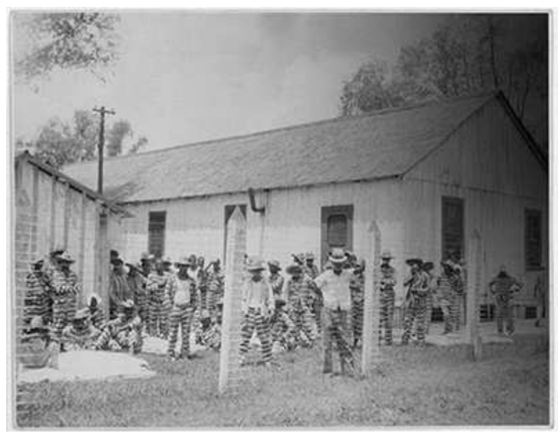
"Leadbelly in the

sentencing laws in the state [and] the whole process of pardon and parole because of its political nature."