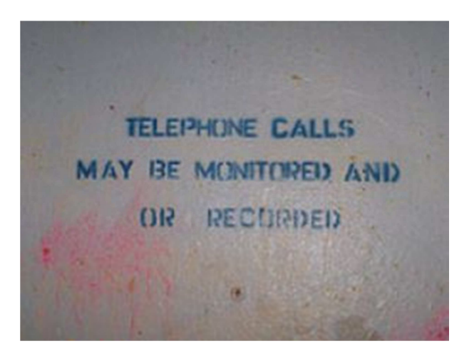
Photo of prison wall used under a Creative Commons license from Flickr user mainmanwalkin.

UPDATE: On July 8, a federal judge in Louisiana overturned Albert Woodfox's 1972 conviction. If the state does not request a retrial, he could be freed in the coming weeks. It is unclear whether the court's ruling will influence the progress of Herman Wallace's appeals.