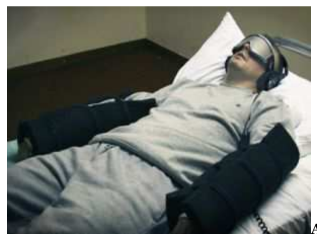
A 2008 BBC reenactment of Donald

In the 1950s, university researchers put volunteers in tiny rooms and deprived them of sensory input. The results were shocking.