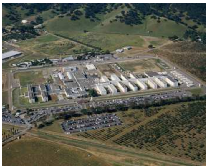
California Medical Facility, Vacaville

At CMF (California Medical Facility) in Vacaville, there are four wings that are supposed to be opening due to the transferring of DMH (Department of Mental Health) inmates to Stockton Medical Facility. Those are L, P, S and Q wings, which are empty for the most part.